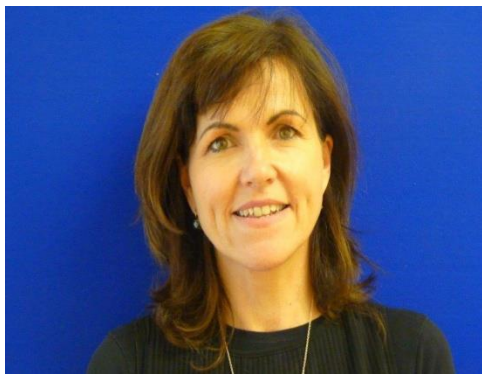
Designated Liaison Person (DLP)